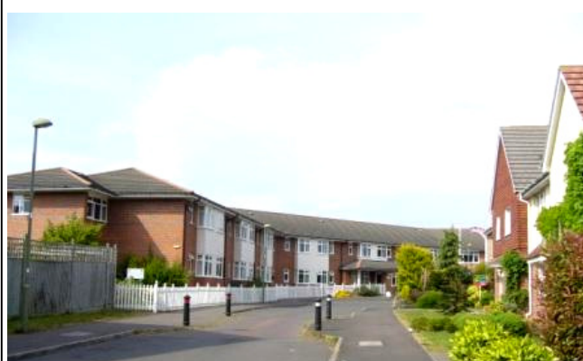
WESTGATE HOUSE CARE HOME MILLINGTON ROAD, WALLINGFORD